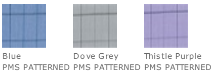
Blue PMS PATTERNED Dove Grey PMS PATTERNED Thistle Purple PMS PATTERNED